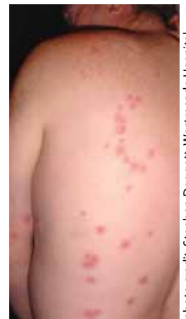
Bed bugs bites.