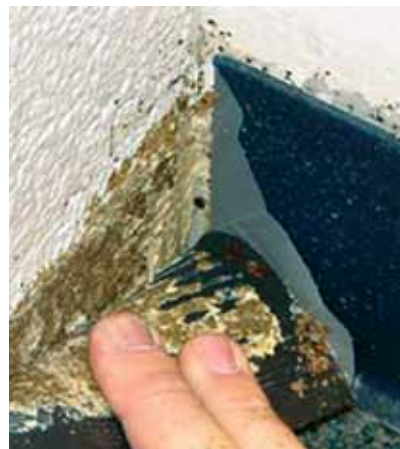
Bed bugs behind baseboard.